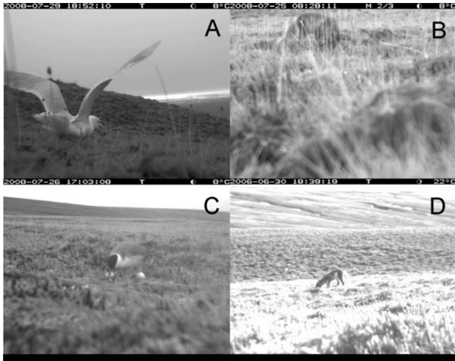
Fig. 3. Photos of confirmed predators of artificial nests, Glaucous Gull (A), Arctic Fox (B), and Long-tailed Jaeger (C), taken at 5 m, and a photo of the only confirmed predator of real nests, Arctic Fox (D), taken at 15 m. In photos B and D, the fox's snout is located directly in the nest.

the presence of a camera did not affect the risk of predation on artificial nests. Moreover, despite smaller sample sizes, the same conclusion was reached for real shorebird nests, where differences in nest survival between nests monitored with and without cameras were minimal compared to natural interannual variation. The results of our experiments conducted in the open Arctic tundra thus concur with those of most studies conducted in temperate regions and suggest that nest survival is not significantly affected by the presence of cameras (Brown et al. 1998, Thompson et al. 1999, Pietz and Granfors 2000, Keedwell and Sanders 2002, Coates et al. 2008).