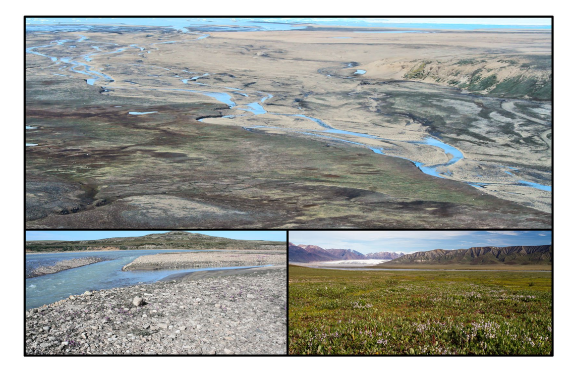
Figure 2. Photos taken at the study site located in the Canadian Arctic and showing two contrasting but adjacent habitats used by nesting plovers. Stony shores (bottom left) found along rivers are the main nesting habitat of the Common Ringed Plover ( Charadrius hiaticula ) while the American Golden Plover ( Pluvialis dominica ) breeds mainly in mesic tundra (bottom right).